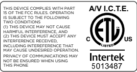
Base label-2 W37mm x H19mm