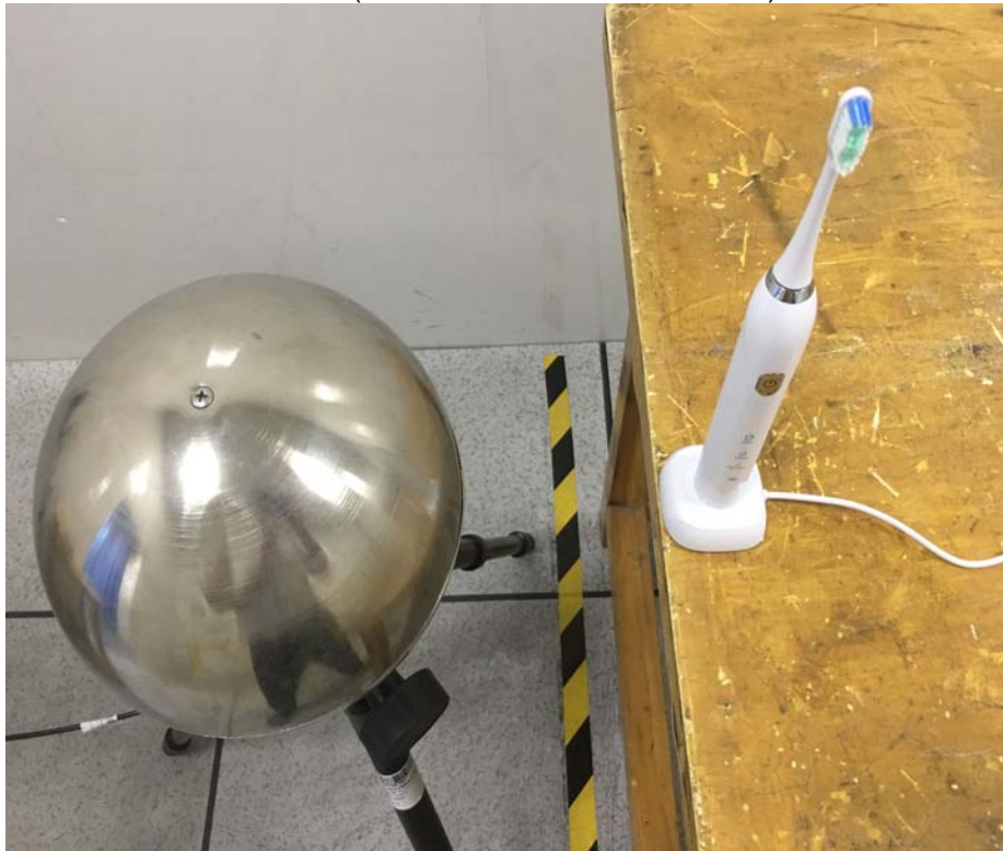
Right Side(measurement distance of 15cm)