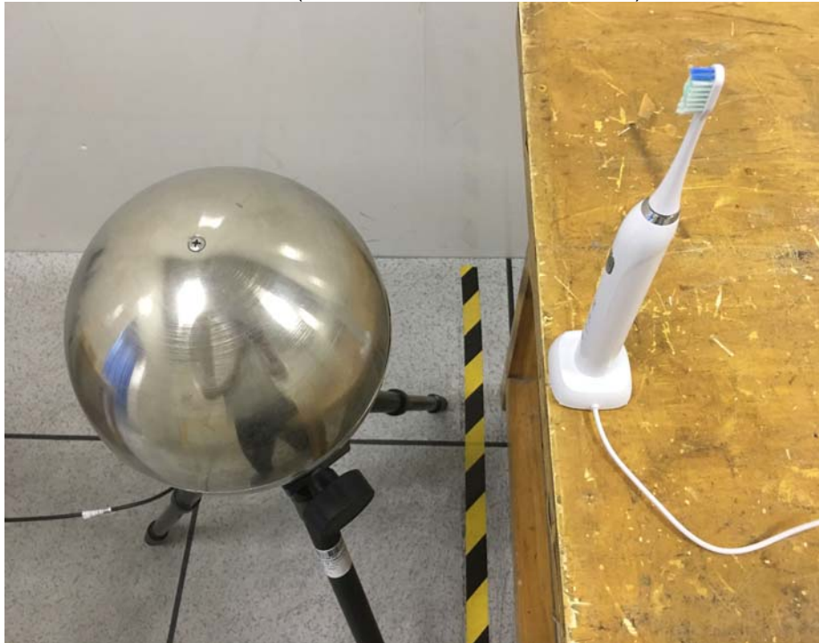
Rear Side(measurement distance of 15cm)