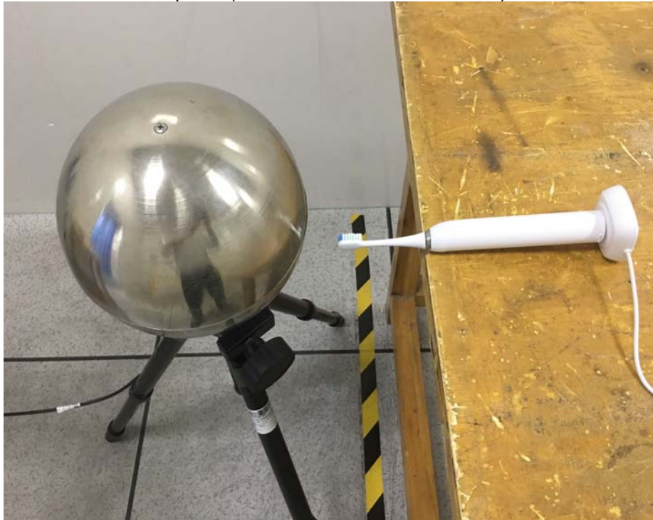
Bottom Side(measurement distance of 15cm)