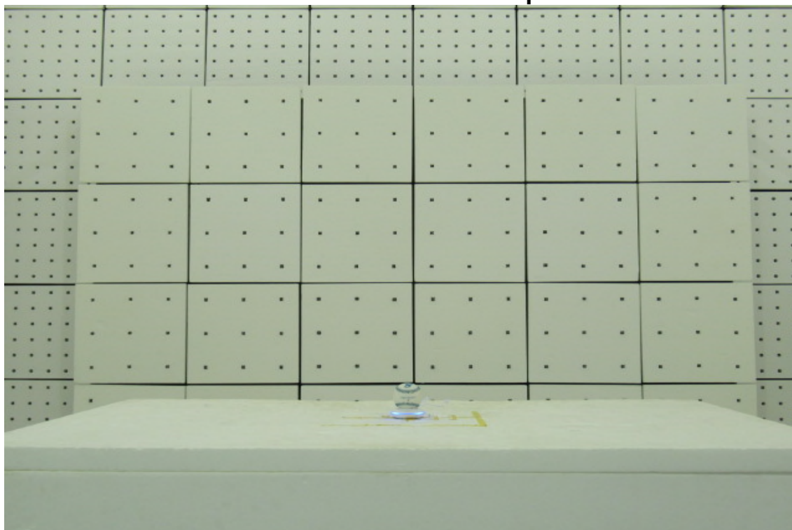
Front View of test setup

Unless otherwise stated the results shown in this test report refer only to the sample(s) tested and such sample(s) are retained for 90 days only.