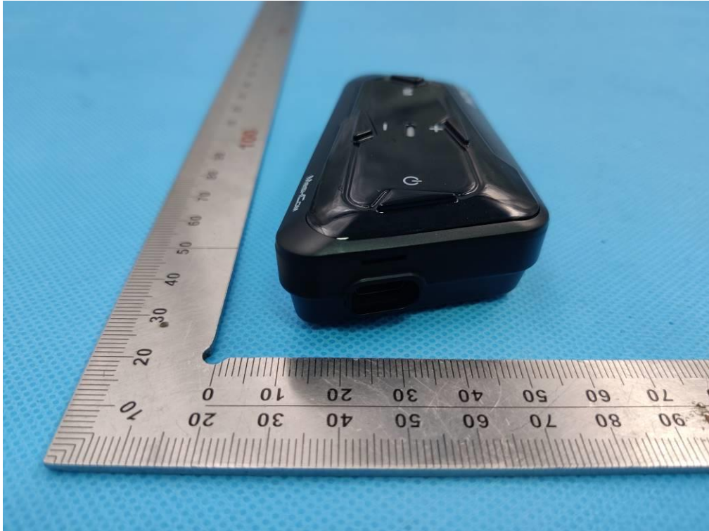
The series model is LX-MTX WHOLE VIEW OF EUT