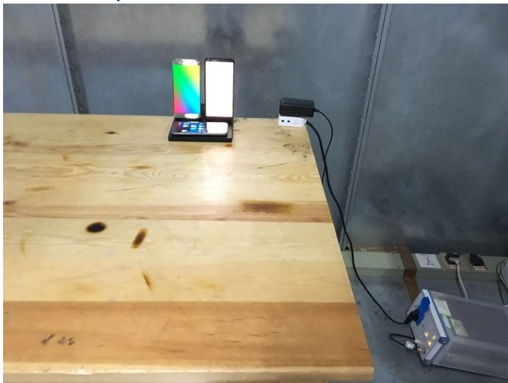
Test Setup Photo of Power Line Conducted Emissions Measurement