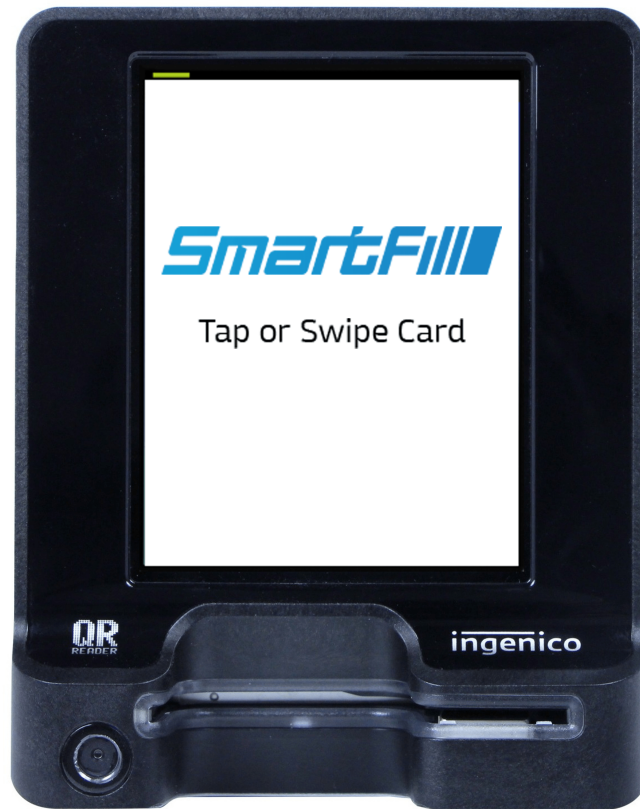
Figure 1.1: SmartFill OPT Payment Hardware