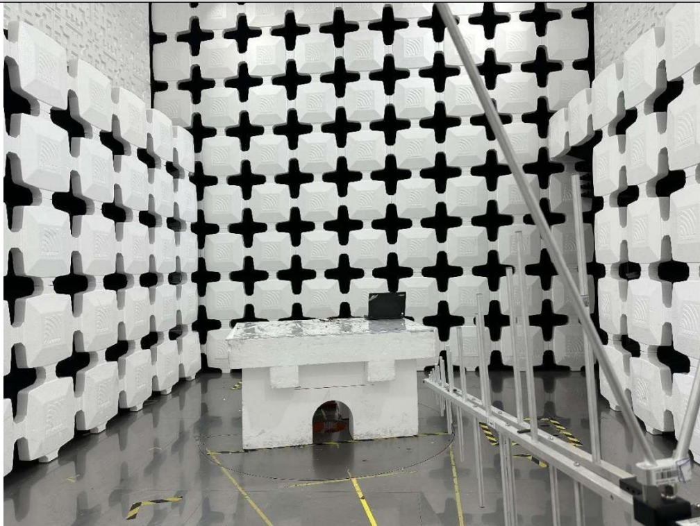
Radiated Emission Above 1G