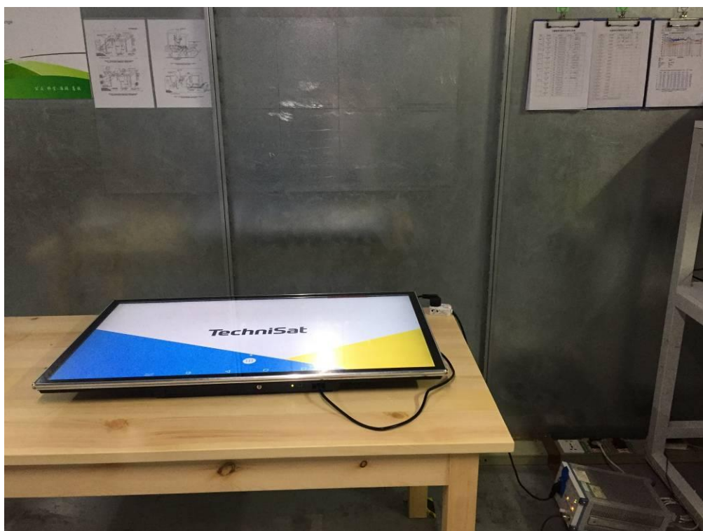
AC Conducted Emission of charge from power adapter mode