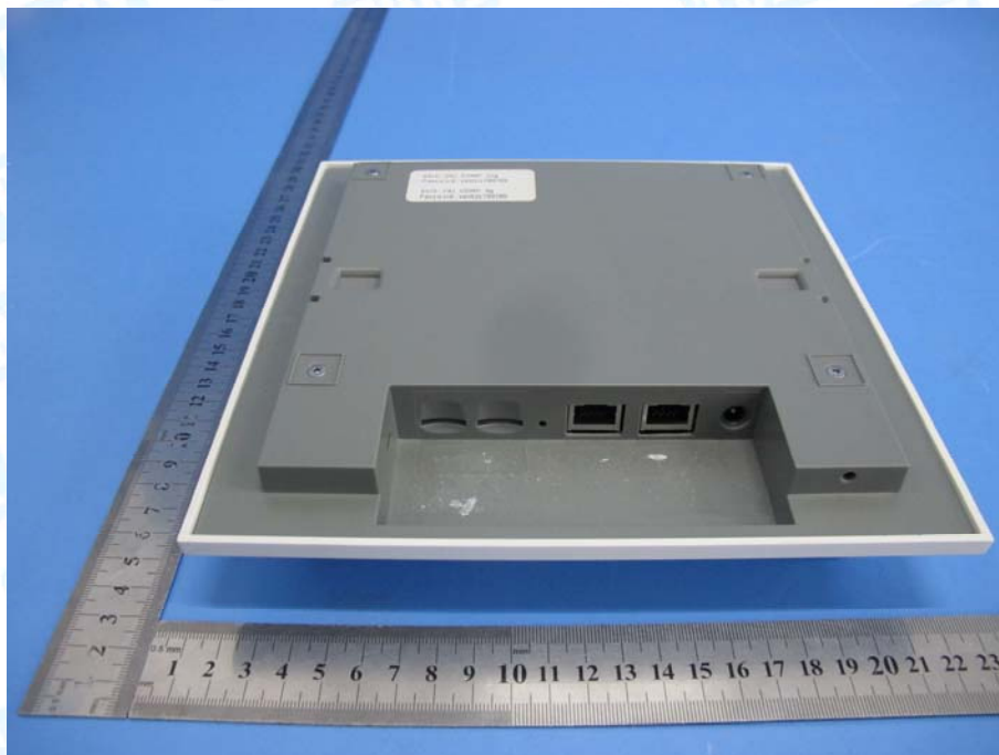
Photo 8 Appearance of EUT