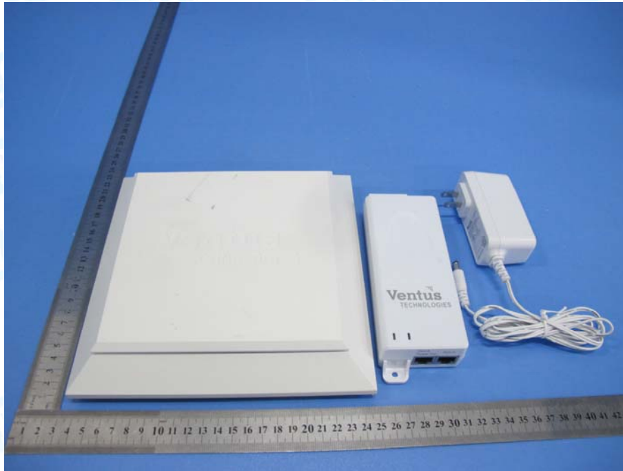
Photo 2 Appearance of AC Adapter