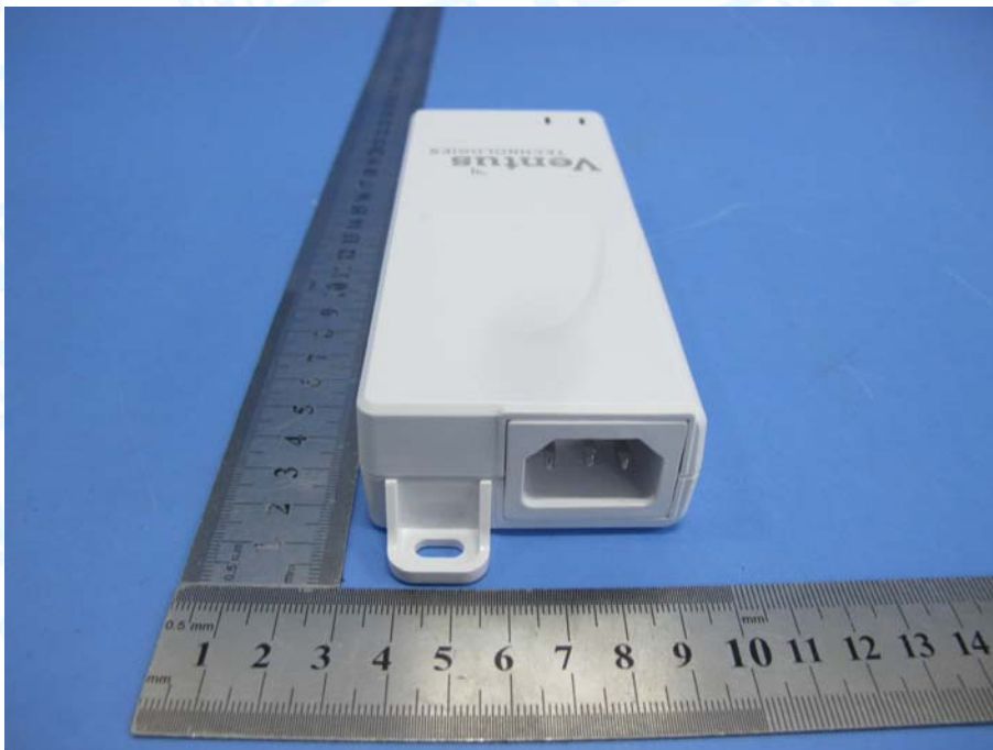
Photo 4 Appearance of POE Power Supply