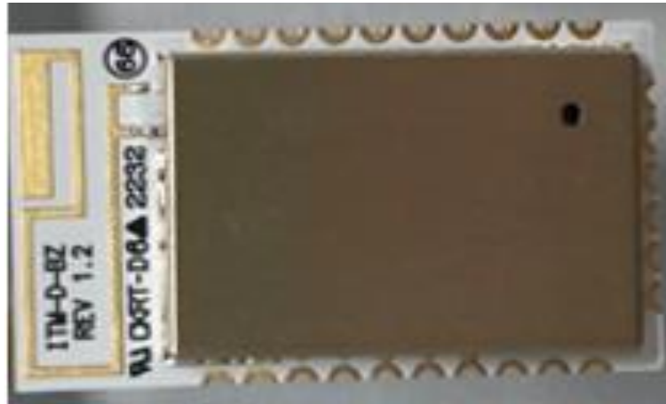
Main Board(Open Shield) - Front Top