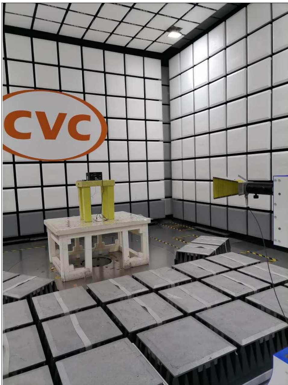
Frequency Range< Above 1GHz >