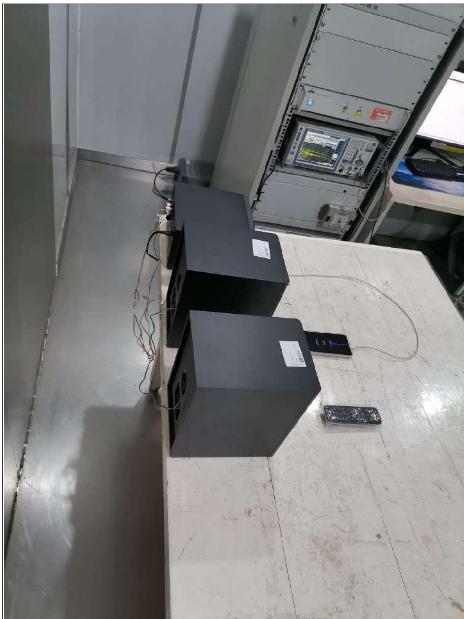
Frequency Range< 150kHz~30MHz >