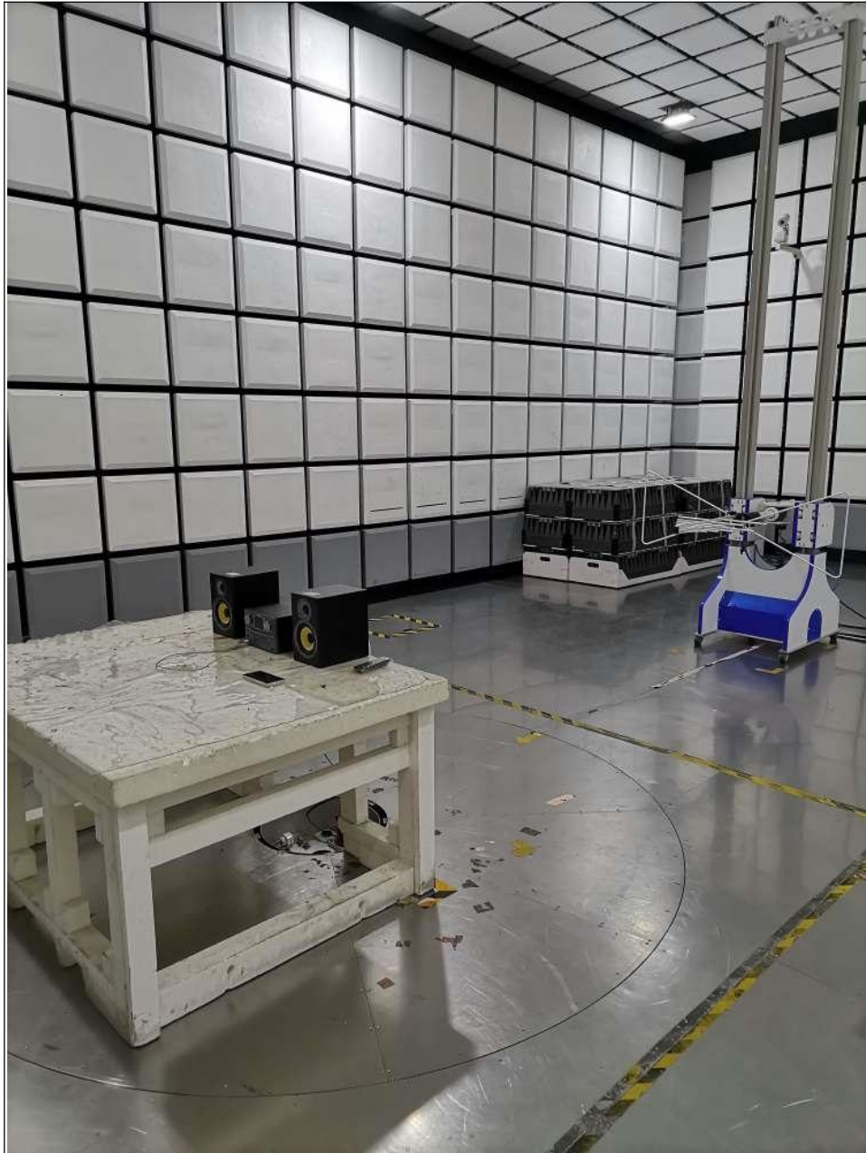
Frequency Range< Below 1GHz >