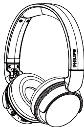
Philips Bluetooth headphones Philips TAH4209