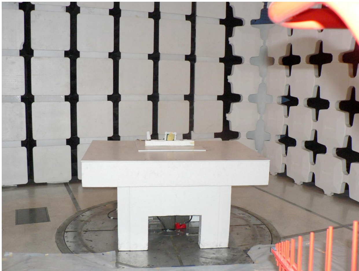
SHOO05 Digital Emissions 30-1000MHz