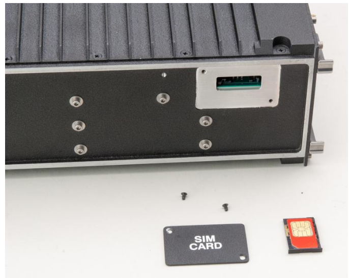
Figure 5: SIM Card & Tray