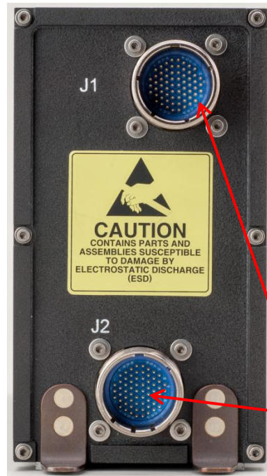
Figure 4: Rear View