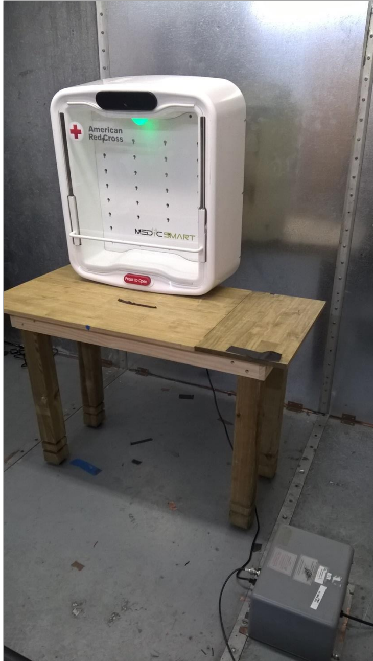
Photograph 1. Conducted Emissions, 15.207(a), Test Setup