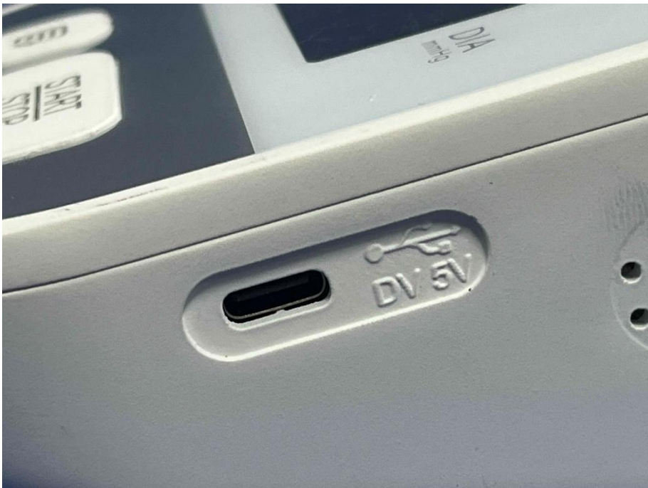
View Of Product-09