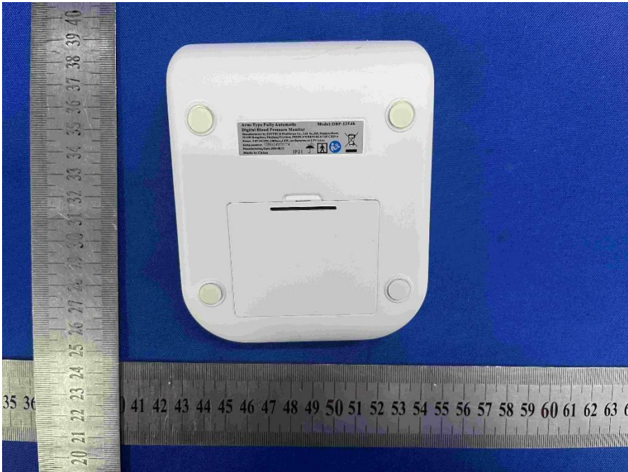
View Of Product-03