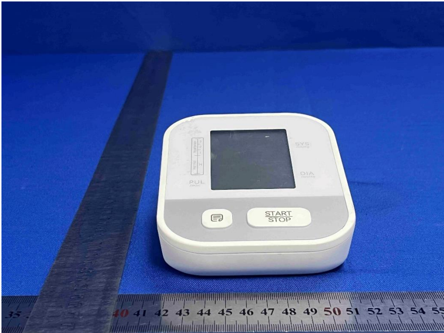
View Of Product-04