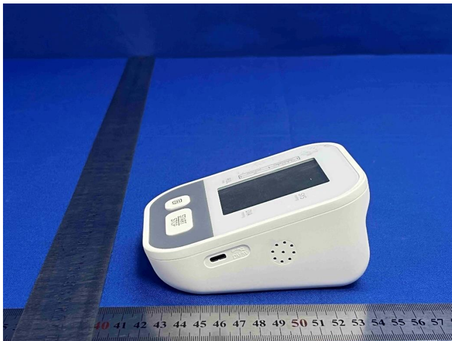
View Of Product-06