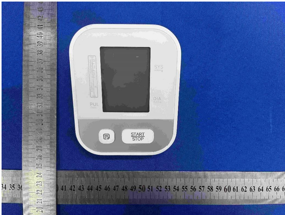
View Of Product-02