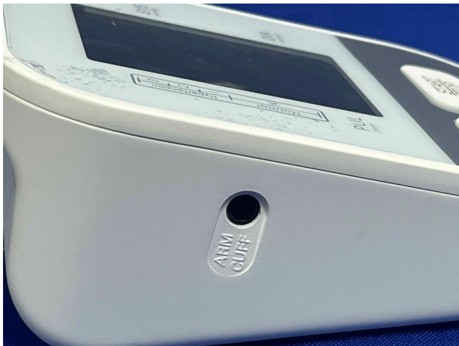
View Of Product-08