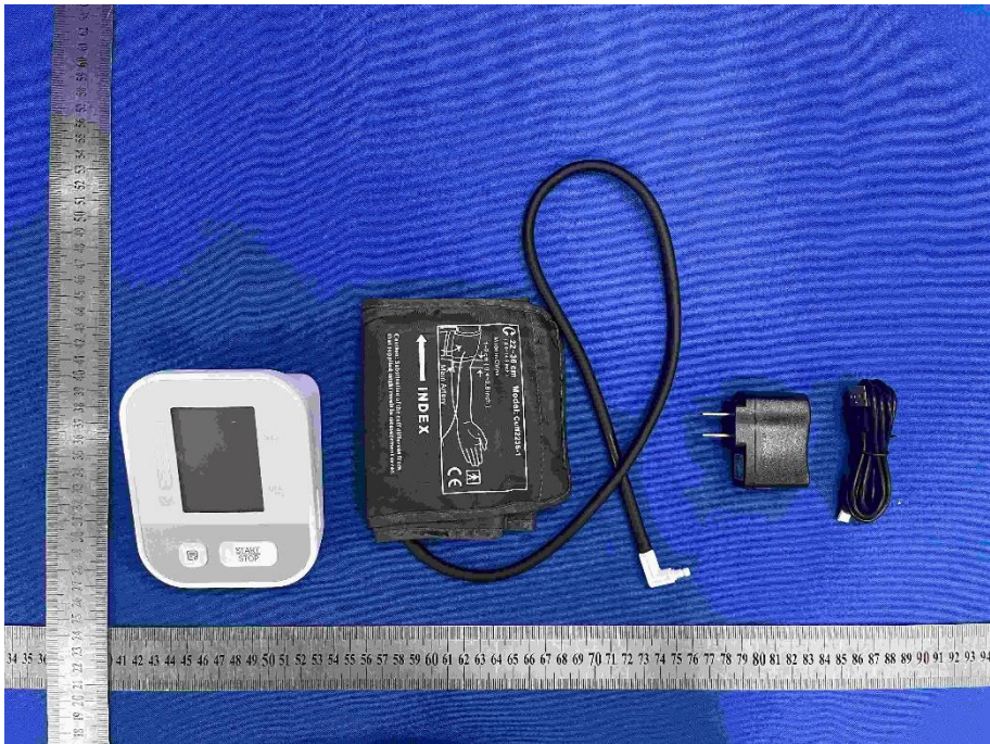
View Of Product-01