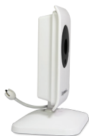
Normal View Baby Unit with no Lens

To use the lens, just screw it onto the Baby Unit as illustrated below: