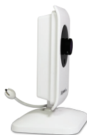
Wide Angle View Baby Unit with the Lens