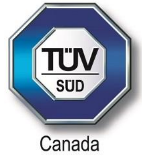
Exhibit: Label Sample & Location