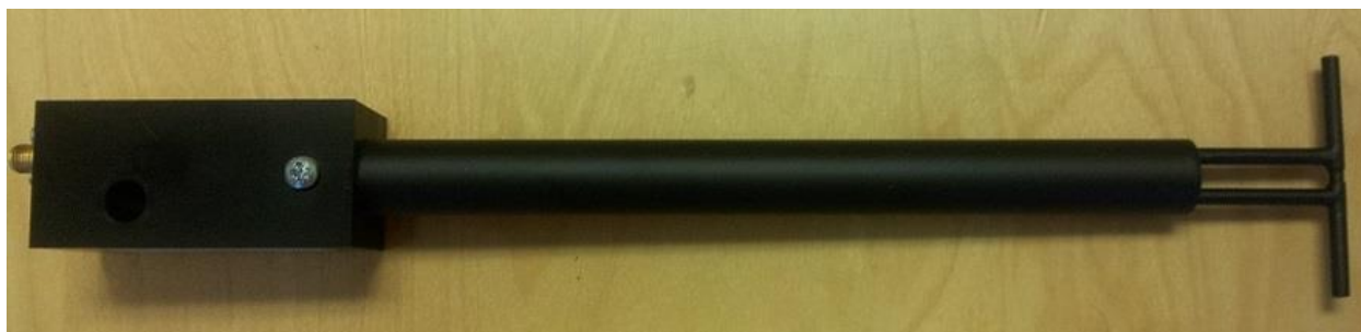
Figure 1 – MVG COMOSAR Validation Dipole

MVG's COMOSAR Validation Dipoles are built in accordance to the IEC/IEEE 62209-1528 and FCC KDB865664 D01 standards. The product is designed for use with the COMOSAR test bench only.