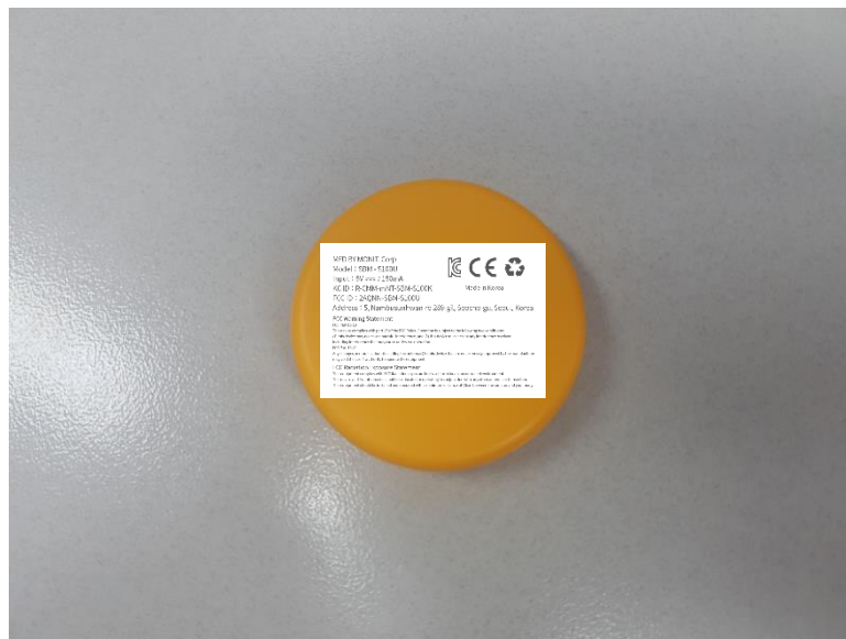
Example of Label Placement