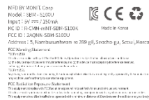
Actual Size of Label