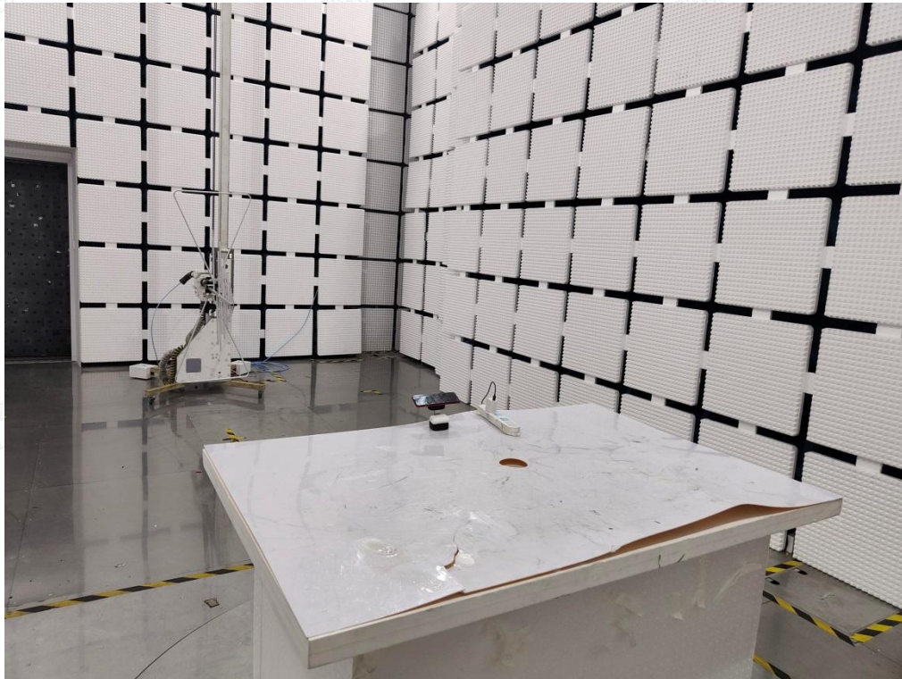
Radiated Emission below 1GHz-AC adapter charge mode