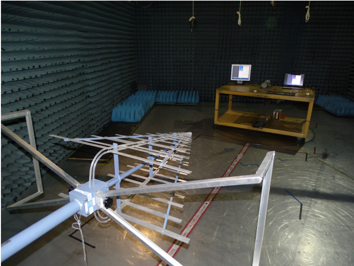
Photo 6: Test setup for radiated measurements (computer peripheral setup, below 1 GHz)