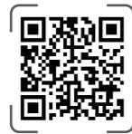
Govee Home App

For FAQs and more information, please visit: www.govee.com