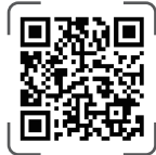
Govee Home App

For FAQs and more information, please visit: www.govee.com