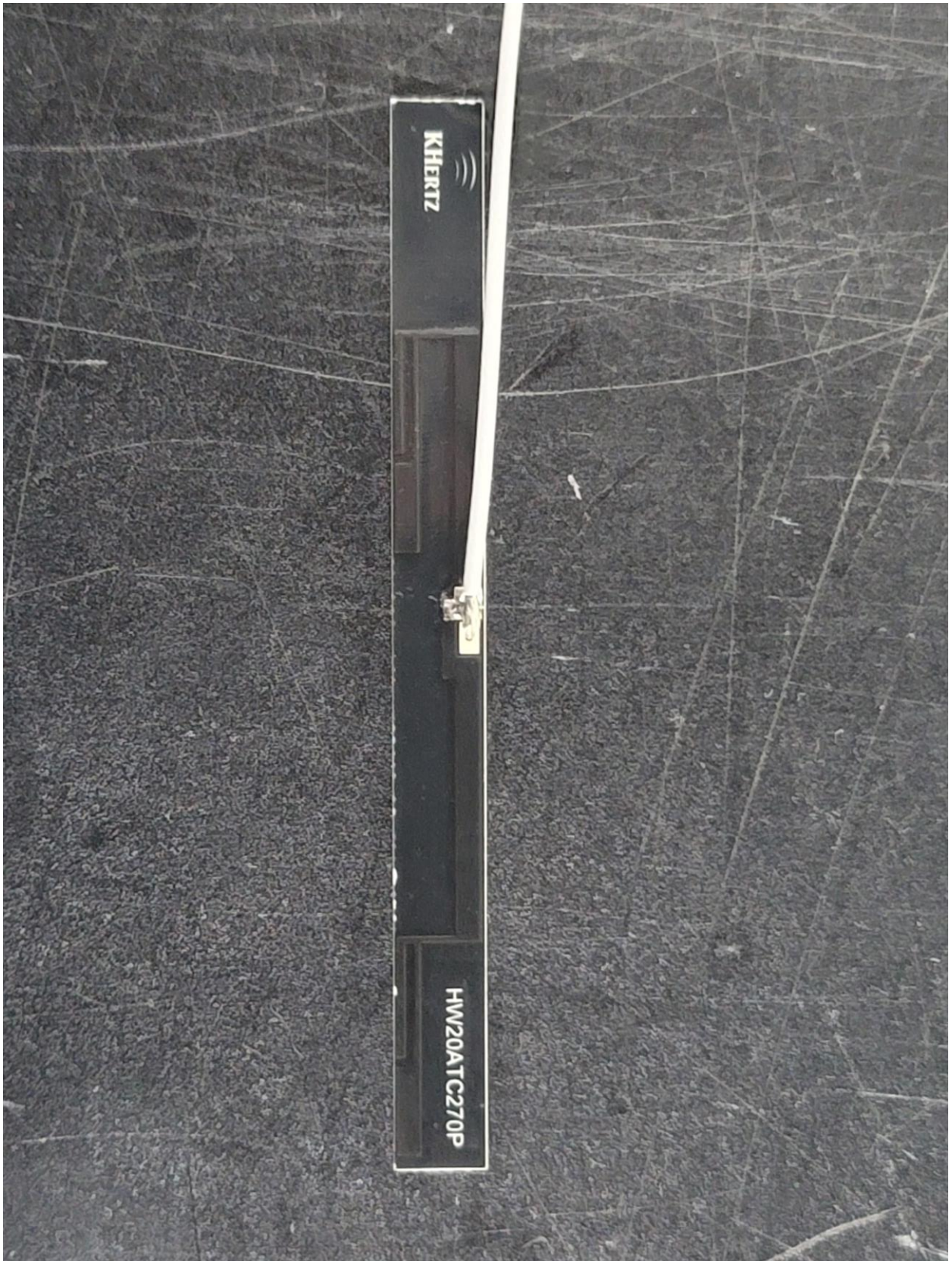
PCB Antenna (Front)