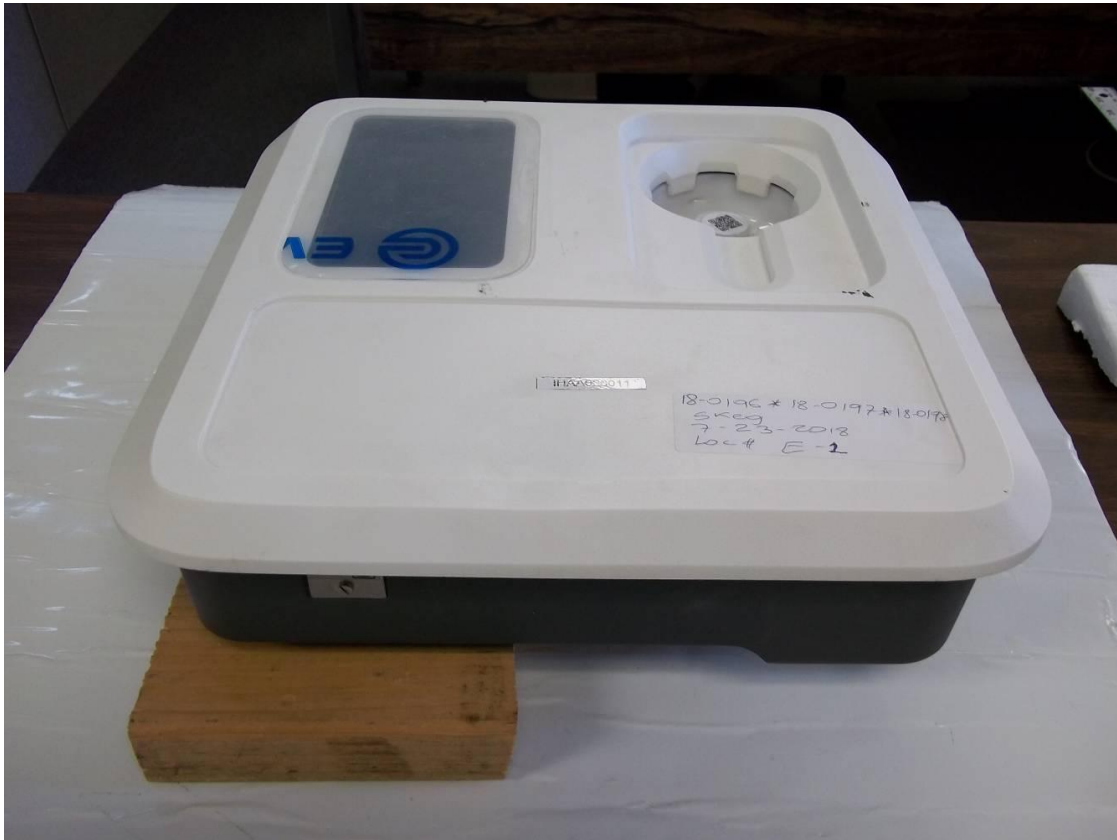
Figure 6. HOST – Side 3

FCC Part 15 Certification 2AQ2P-IHB 24263-IHB 18-0197 November 7, 2018 Skeg Product Development IntelliHead