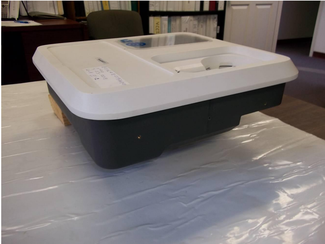
Figure 4. HOST – Side1

FCC Part 15 Certification 2AQ2P-IHB 24263-IHB 18-0197 November 7, 2018 Skeg Product Development IntelliHead