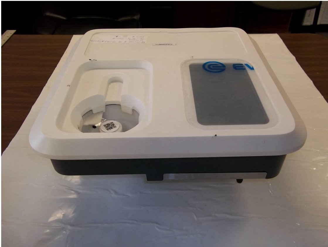
Figure 7. HOST – Side 4

FCC Part 15 Certification 2AQ2P-IHB 24263-IHB 18-0197 November 7, 2018 Skeg Product Development IntelliHead