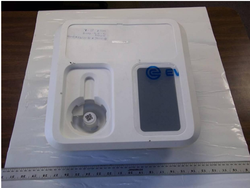
Figure 3. HOST Device

FCC Part 15 Certification 2AQ2P-IHB 24263-IHB 18-0197 November 7, 2018 Skeg Product Development IntelliHead