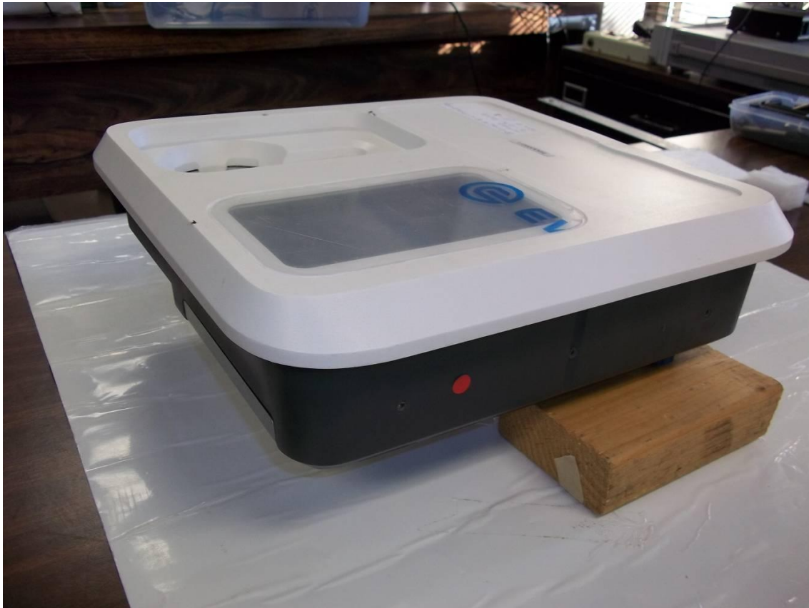
Figure 5. HOST – Side 2

FCC Part 15 Certification 2AQ2P-IHB 24263-IHB 18-0197 November 7, 2018 Skeg Product Development IntelliHead