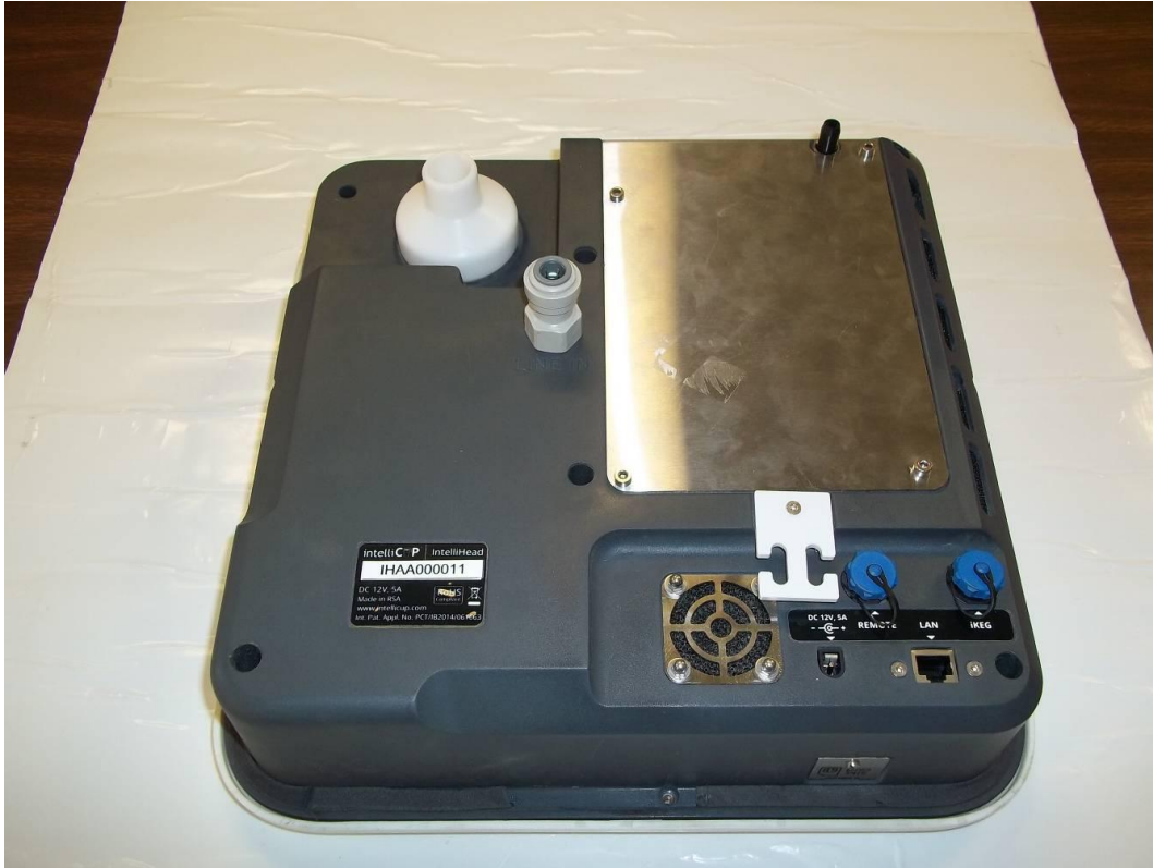
Figure 8. HOST – Back

FCC Part 15 Certification 2AQ2P-IHB 24263-IHB 18-0197 November 7, 2018 Skeg Product Development IntelliHead