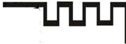
Antenna Length (mm)