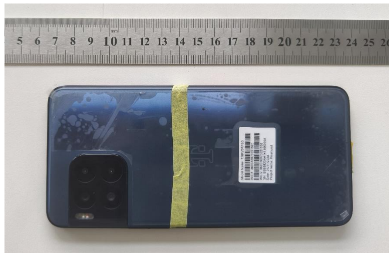
Pic 2 Mobile Phone(back)