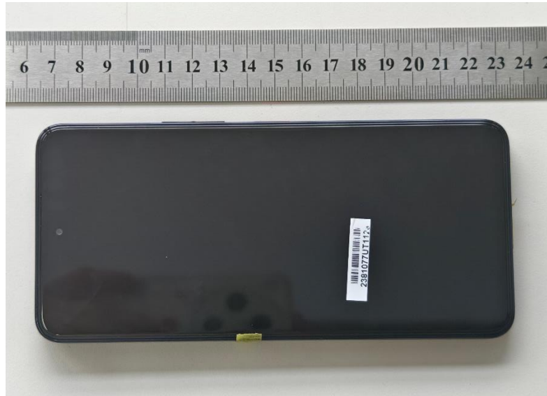
Pic 1 Mobile Phone(top)