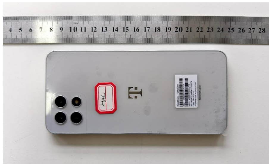
Pic 2 Mobile Phone(back)