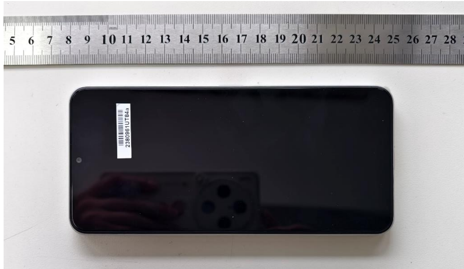
Pic 1 Mobile Phone(top)