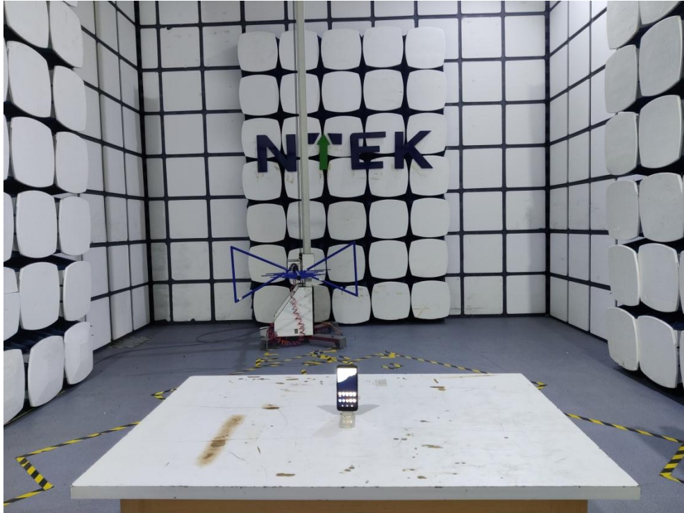
Radiated Measurement Photos