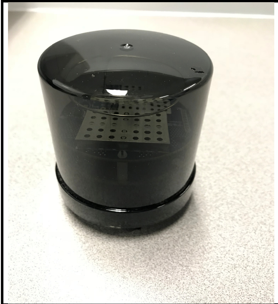
External Photo # 3 – Assembly View