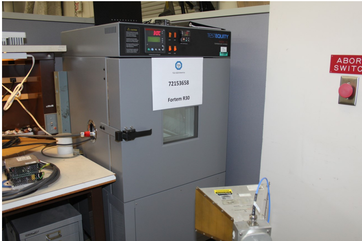
Frequency Stability/Voltage Variation Test Setup