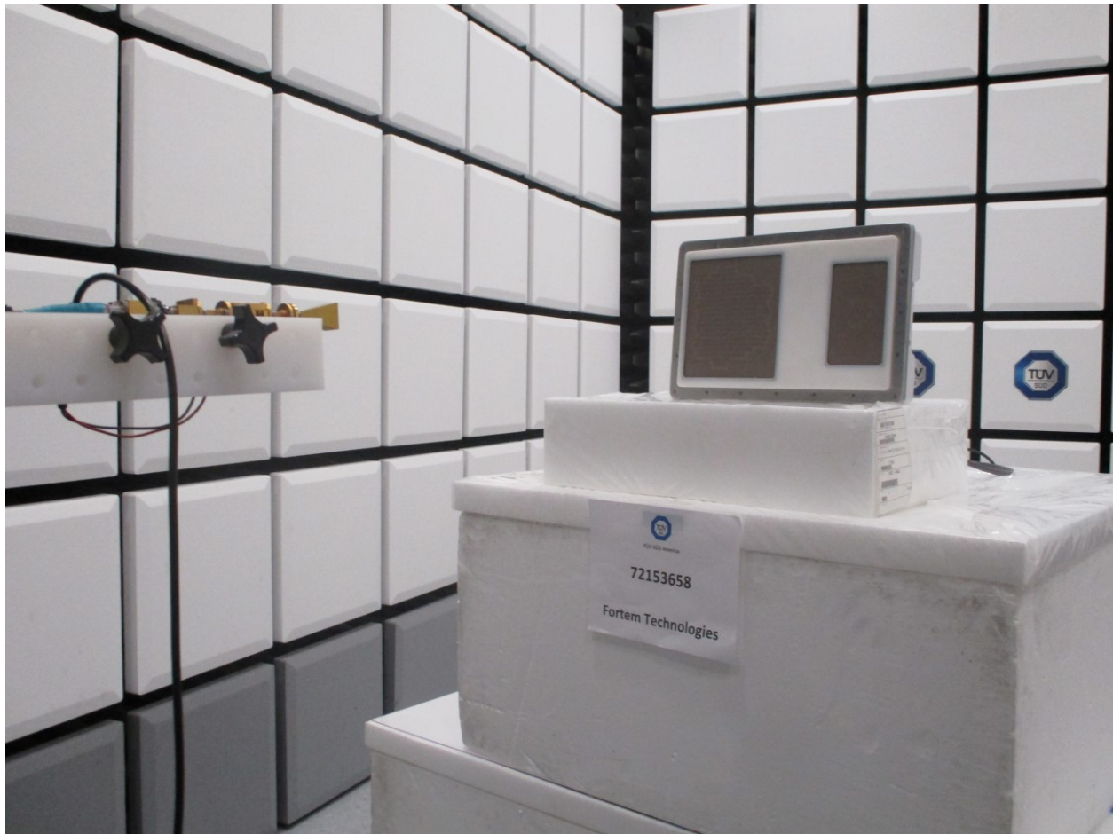
Radiated Emissions Test Setup (above 40GHz)