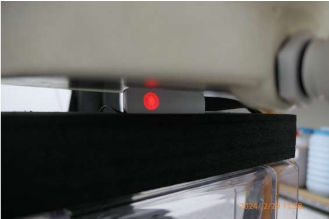
Right from ELI Phantom (Separation Distance: 0 cm)

This Report is not correlated with the authentication of KOLAS.