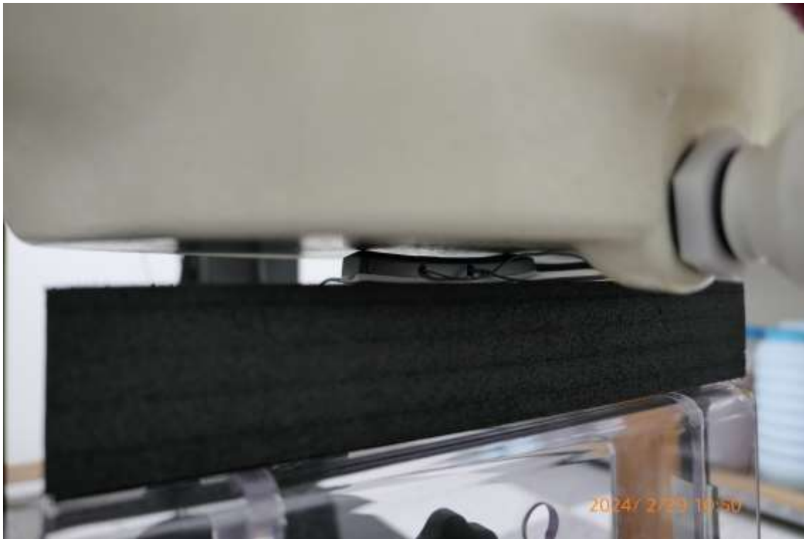
Rear from ELI Phantom (Separation Distance: 0 cm)

This Report is not correlated with the authentication of KOLAS.