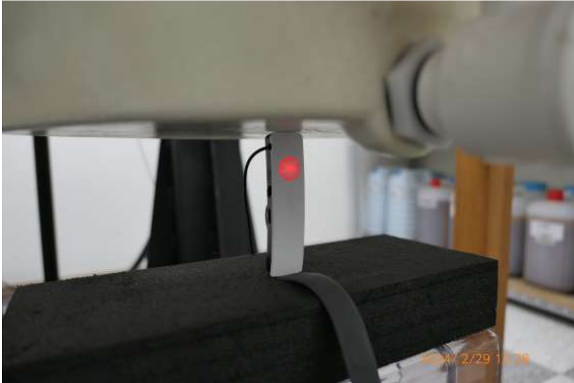
Top from ELI Phantom (Separation Distance: 0 cm)