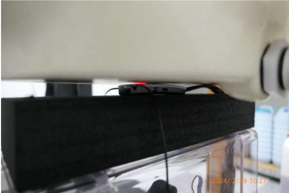
Front from ELI Phantom (Separation Distance: 0 cm)