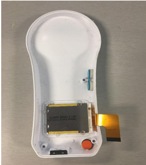
Top Case Assembly