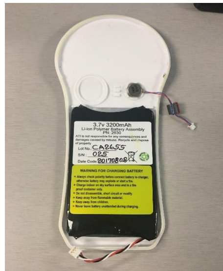
Bottom Case Assembly