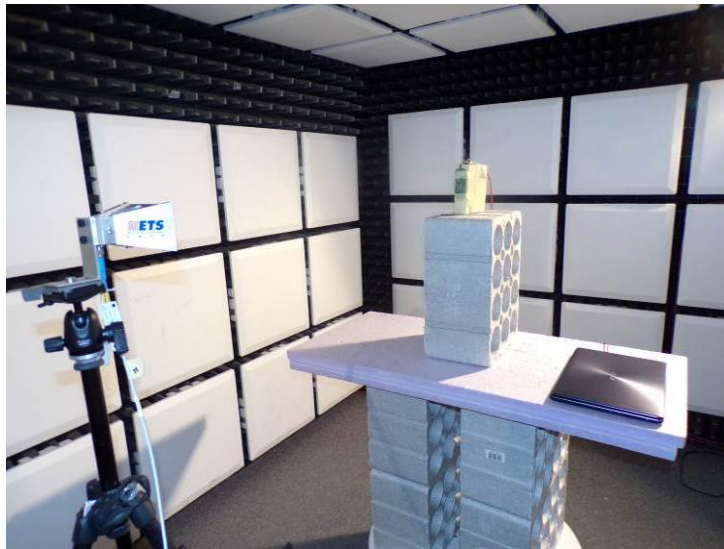
Radiated emission (Test setup for frequency 18-25GHz / 1m distance pre-scan)