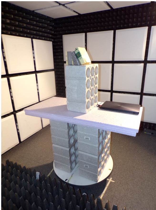
Radiated emission (Test setup for frequency >1GHz)