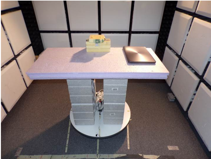
Radiated emission (Test setup for frequency <1GHz, pre-scan)