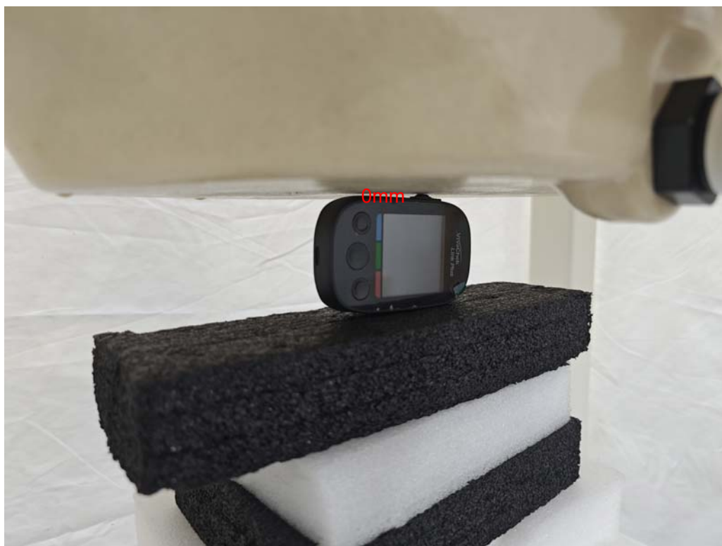
Picture 5: Left Edge, the distance from handset to the bottom of the Phantom is 0mm