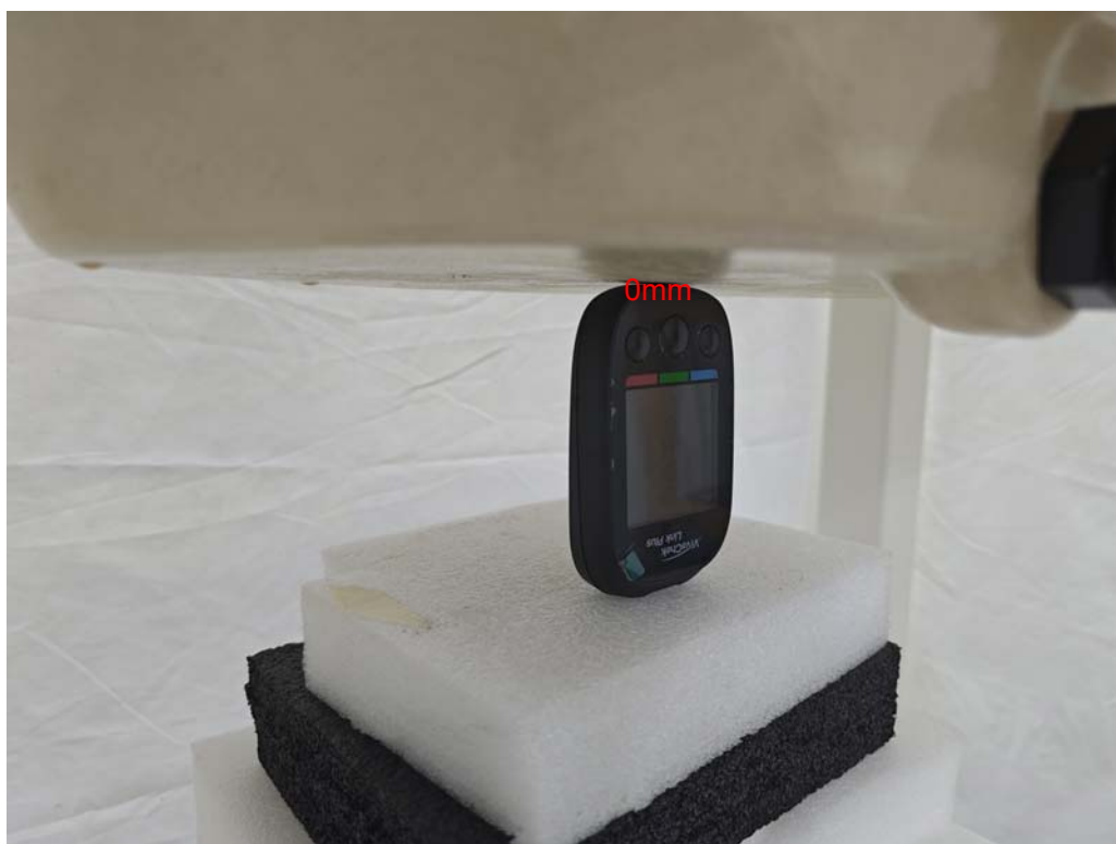
Picture 8: Bottom Edge, the distance from handset to the bottom of the Phantom is 0mm