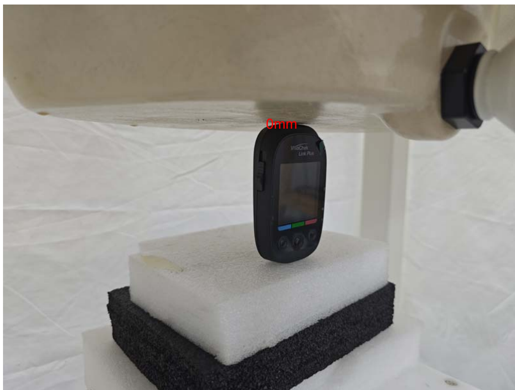
Picture 7: Top Edge, the distance from handset to the bottom of the Phantom is 0mm