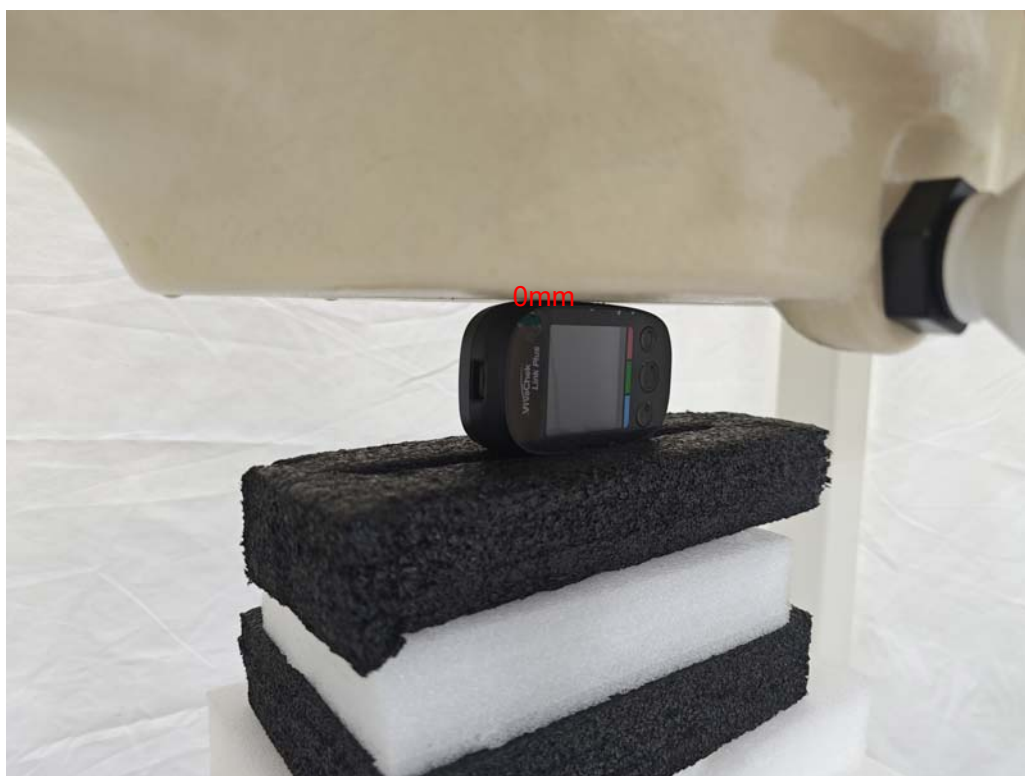
Picture 6: Right Edge, the distance from handset to the bottom of the Phantom is 0mm