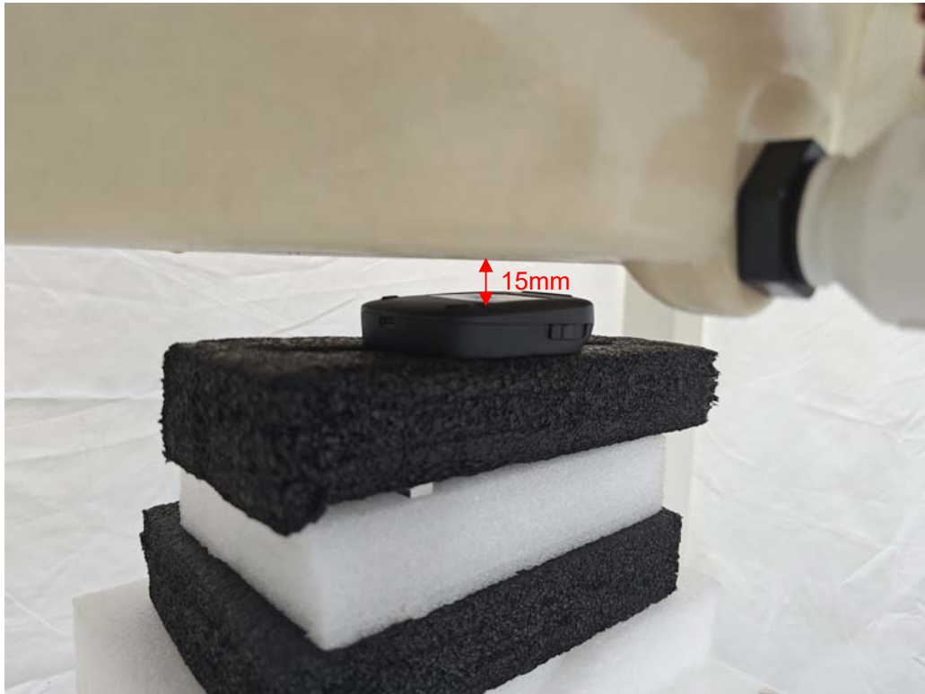
Picture 1: Back Side, the distance from handset to the bottom of the Phantom is 15mm