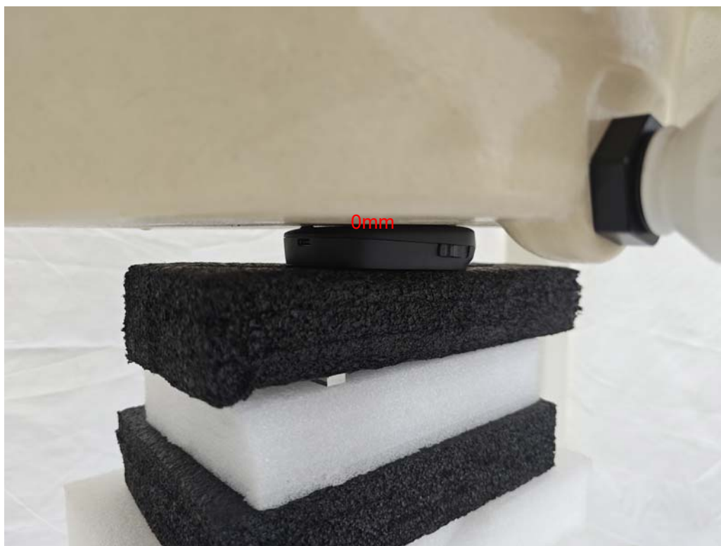
Picture 3: Back Side, the distance from handset to the bottom of the Phantom is 0mm