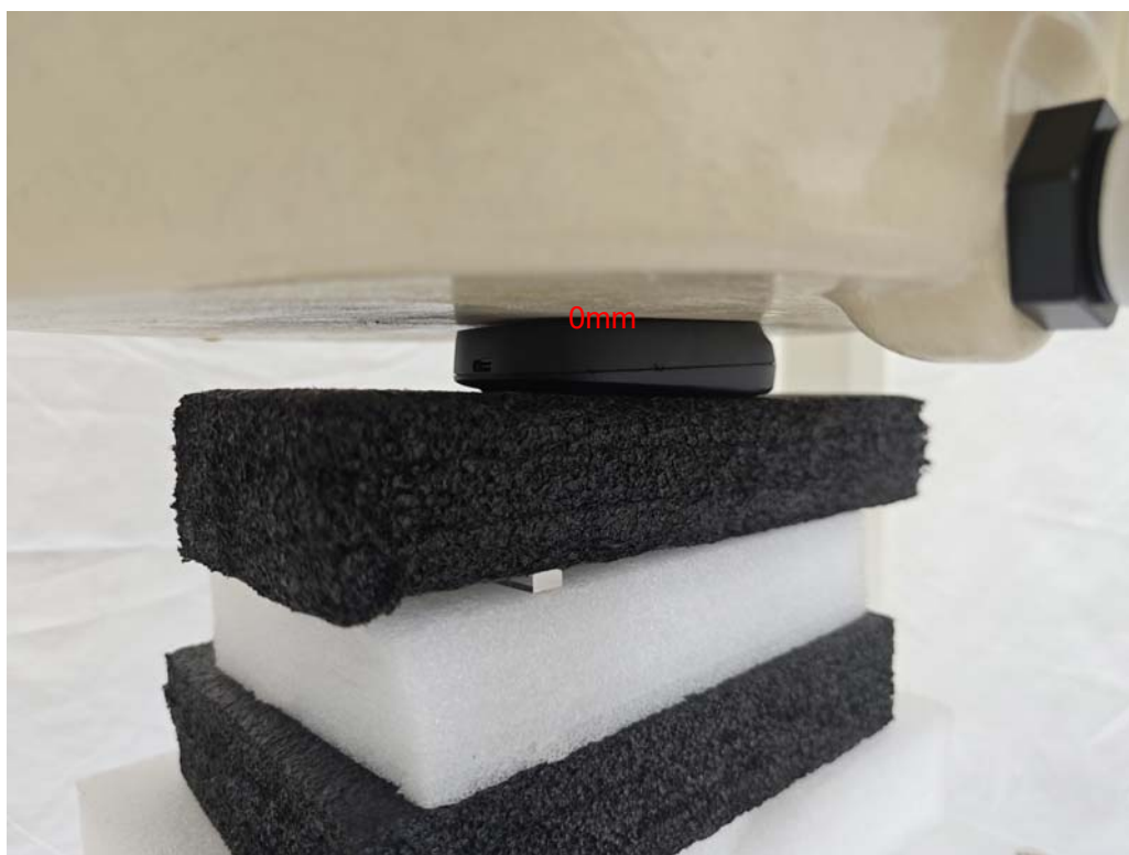
Picture 4: Front Side, the distance from handset to the bottom of the Phantom is 0mm