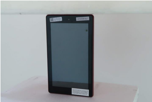
Edge1, Test Separation 0 mm