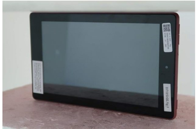
Edge4, Test Separation 0 mm