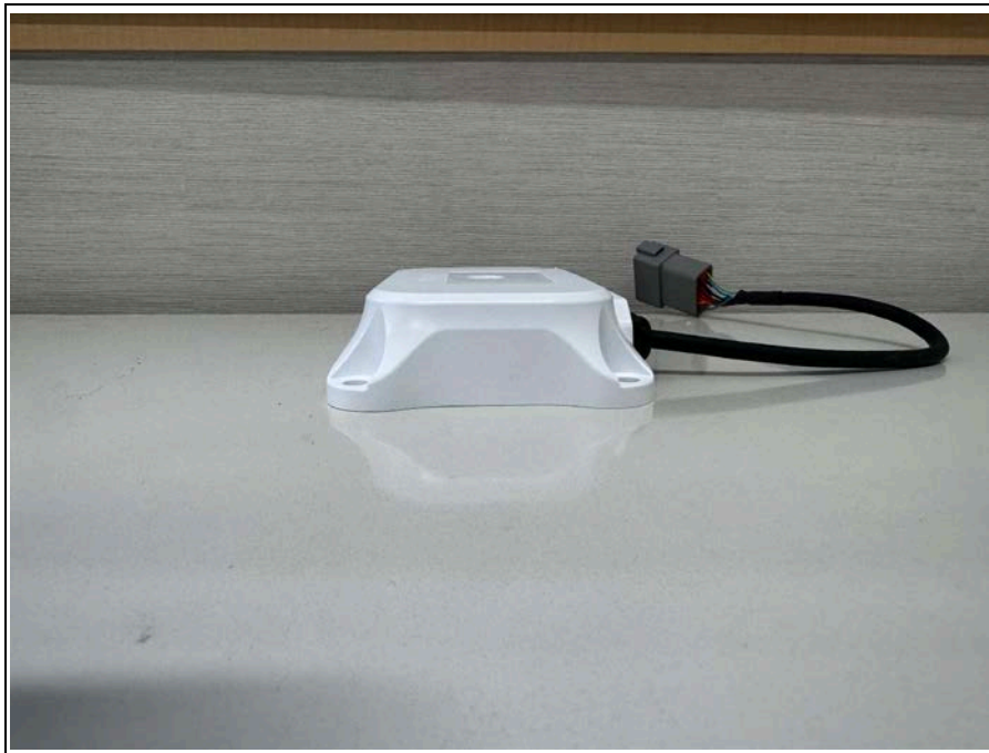
Model Name: RMCU M5