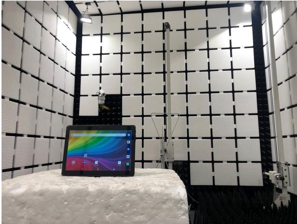
Fig. 1 (Below 1GHz)