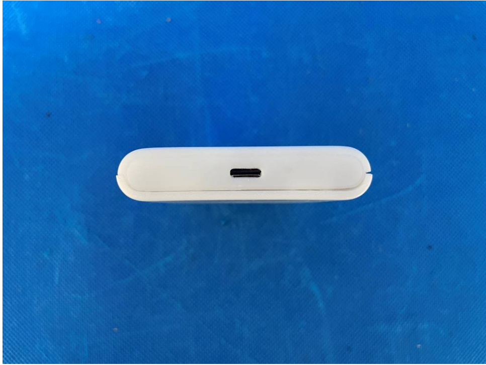
Figure 3 Terminal view