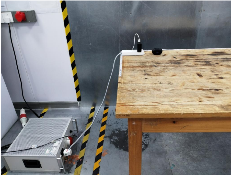
Emissions in frequency bands (below 1GHz)