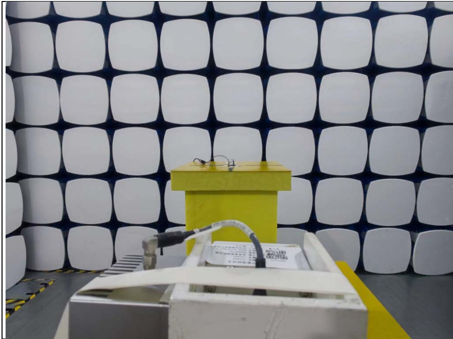
18GHz to 26.5GHz