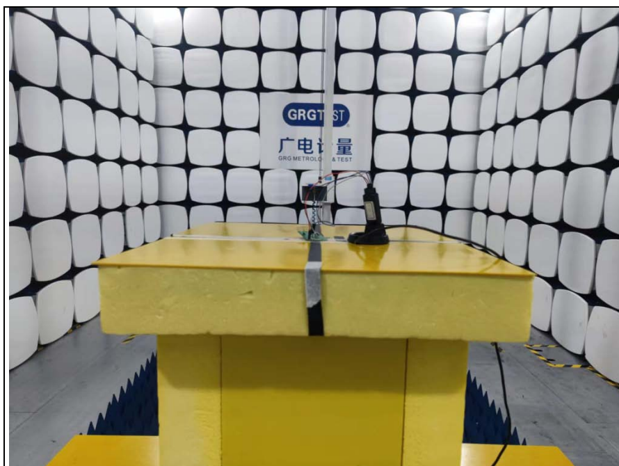
1GHz to 18GHz