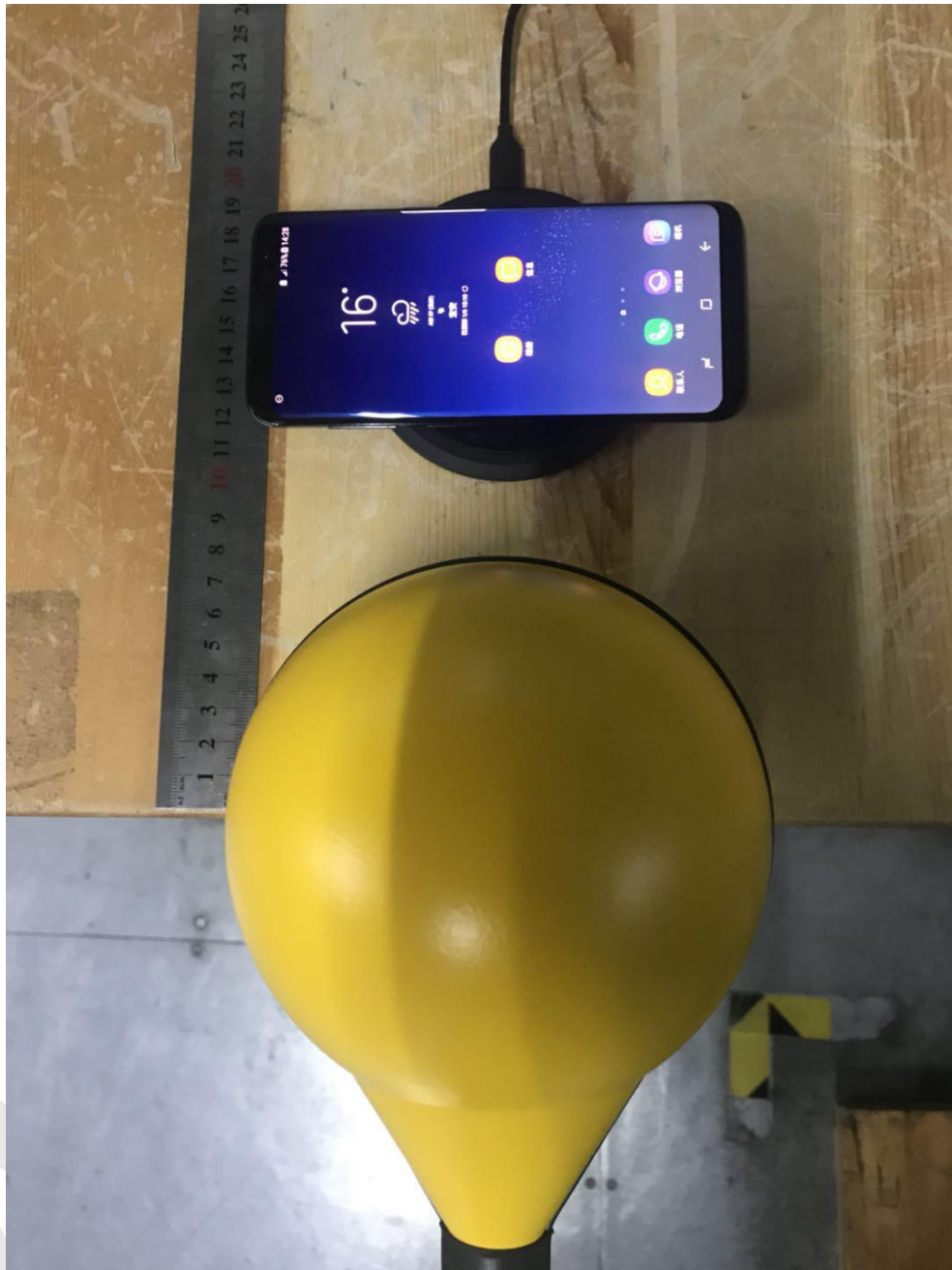
D is the front