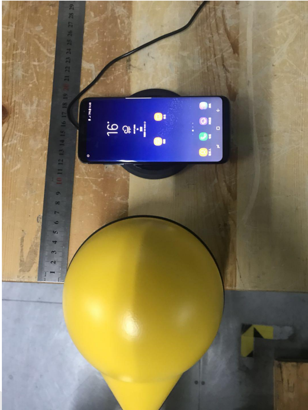
C is the left