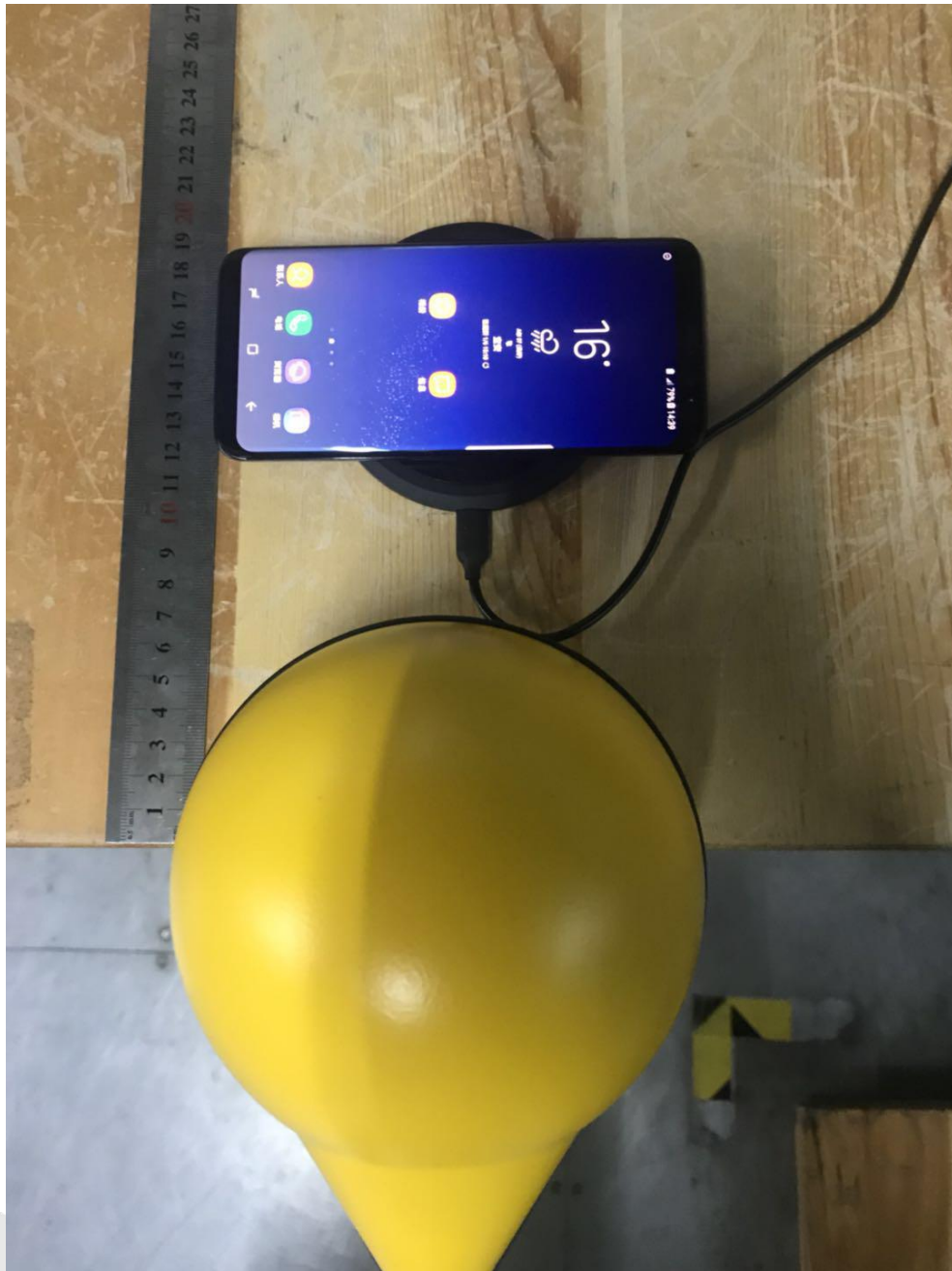
B is the back