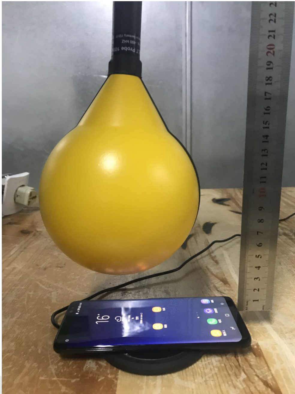
E is the Top