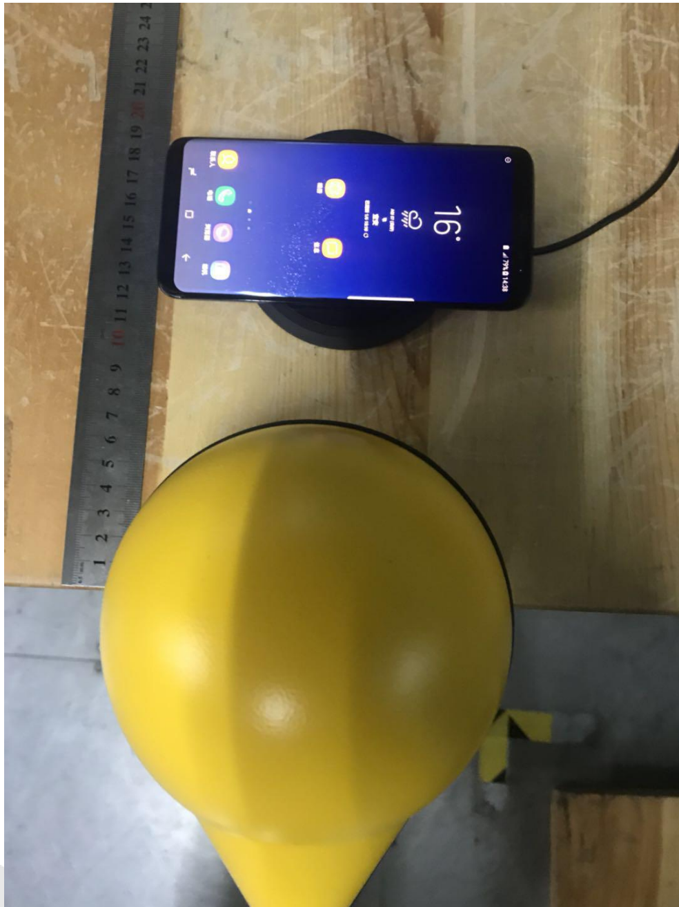
A is the right