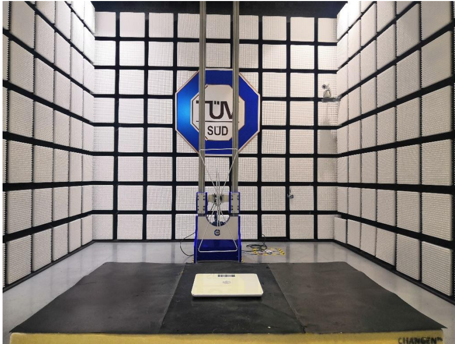
Radiated Emission Test 1GHz-18GHz