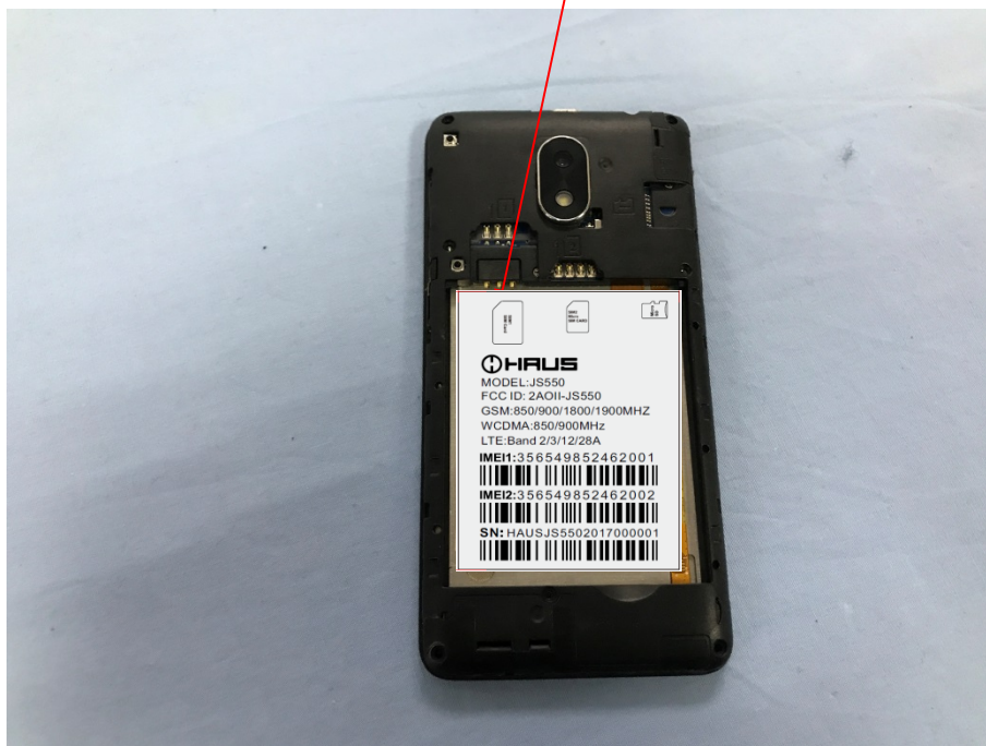
FCC Label Location