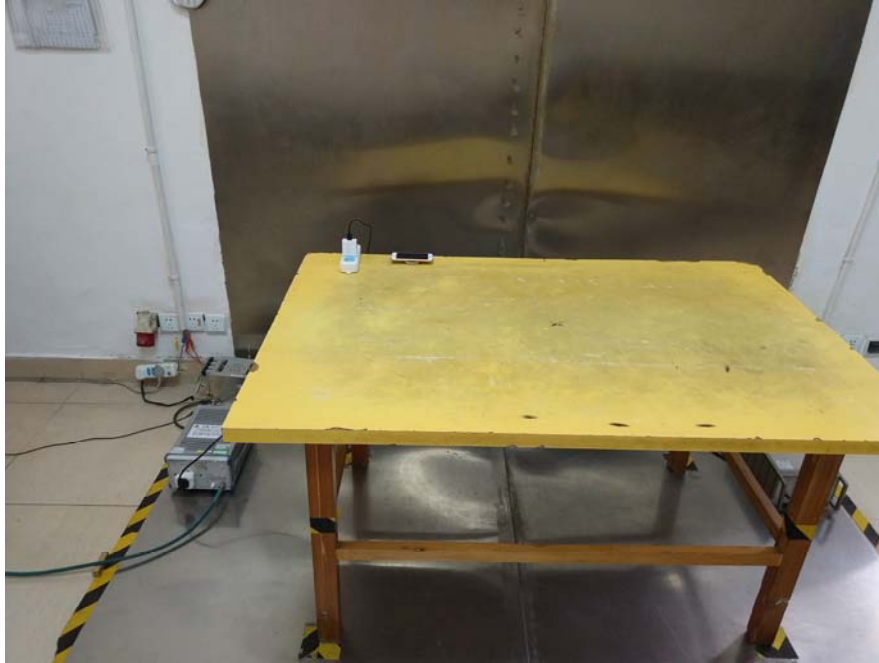
Conducted Emission Rear View