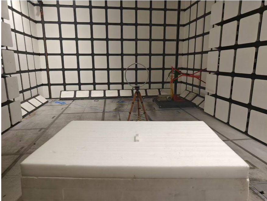
Radiated Emissions View (30 MHz- 1 GHz)