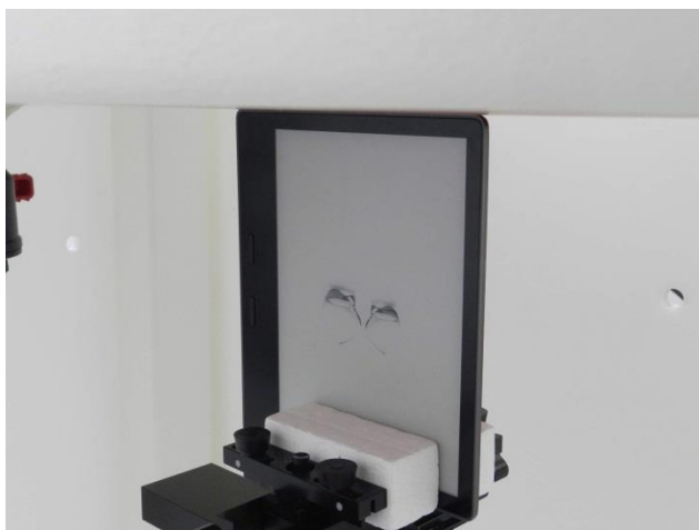
Edge4, Test Separation 0 mm