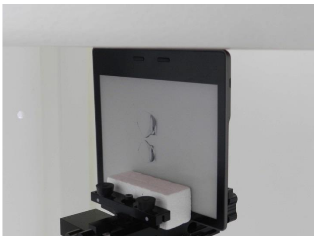
Edge3, Test Separation 0 mm