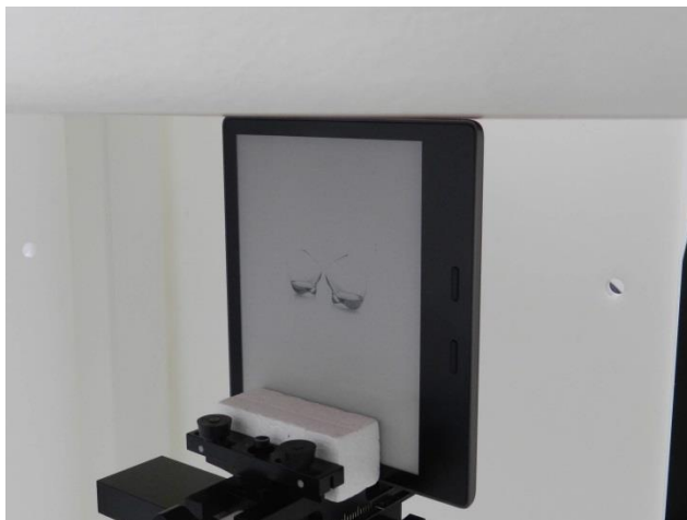
Edge2, Test Separation 0 mm