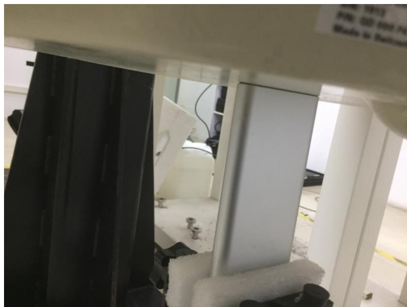
Body Bottom side 0mm