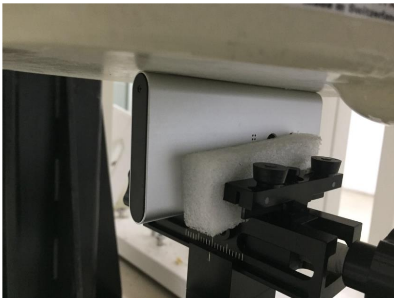
Body Left side 0mm