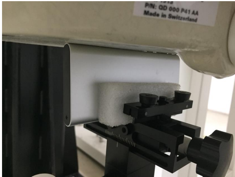
Body Right side 0mm