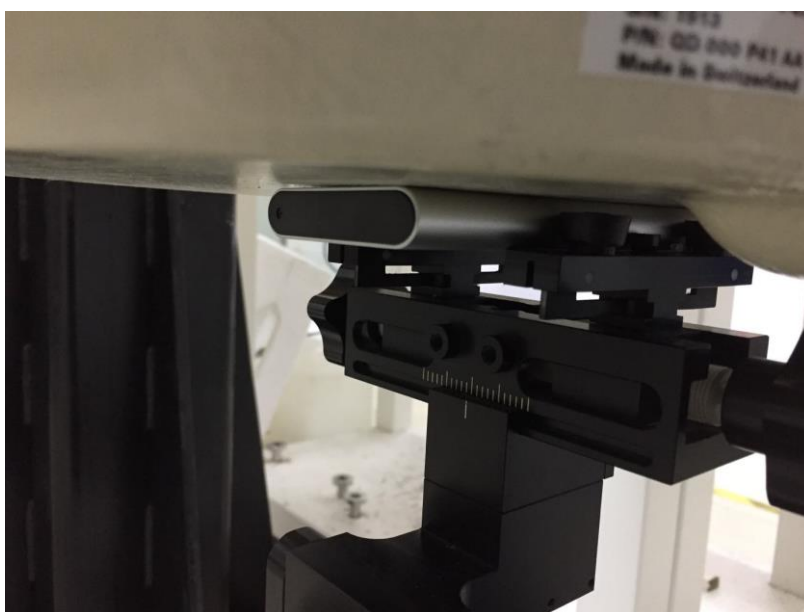
Body Front side 0mm