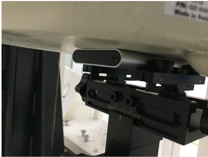
Body Back side 0mm