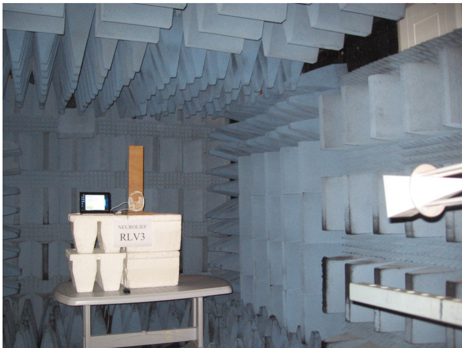
Radiated Emission Test, 18-26.5GHz