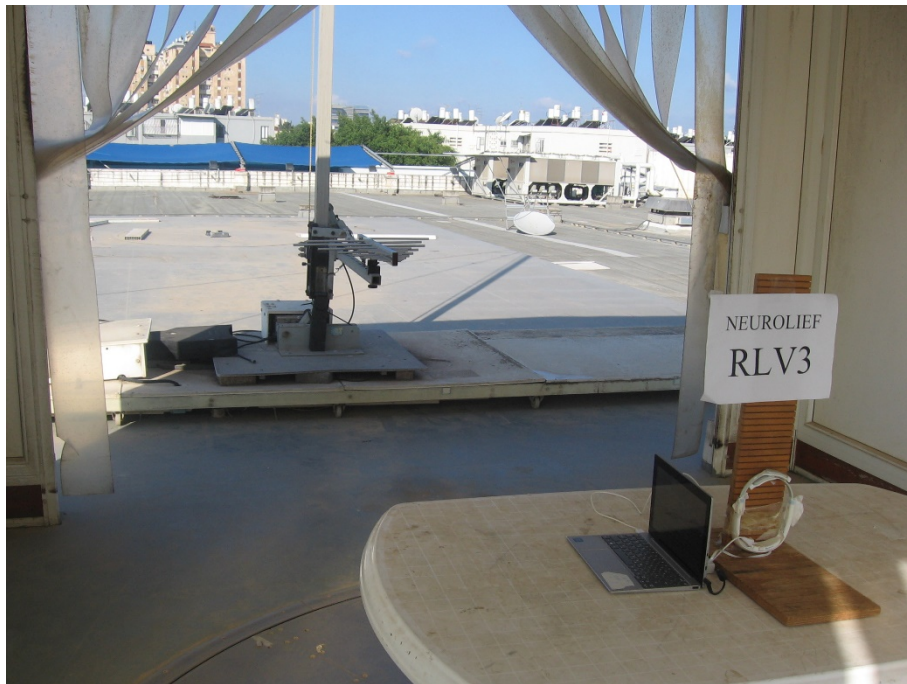
Radiated Emission Test, 200-1000MHz