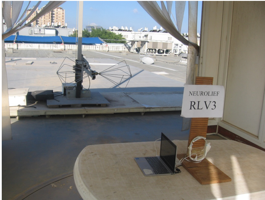
Radiated Emission Test, 30-200MHz